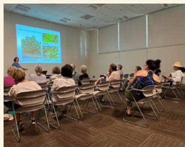
Top: Family-friendly tree walk Middle: Tabling at Homestead High School Bottom: Presentation at the Sunnyvale Senior Center

Advocacy Engagements to council members resulted in approved funding for the study issue "Street Tree Repopulation with an Equity Lens". We also reached out to the Parks and Rec Commission in support of the Cherry Chase Natural Areas project. To ensure study issues and tree concerns are implemented, SUFA will remain active in writing and meeting with council members as well as speaking at council meetings.