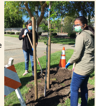
Tree planting at Braly Park

Participation Opportunities. As part of our community outreach, SUFA participated in the tree planting of five crepe myrtles at Cupertino Middle School and ten flowering cherry trees at Braly Park, to celebrate the City's Arbor Day.