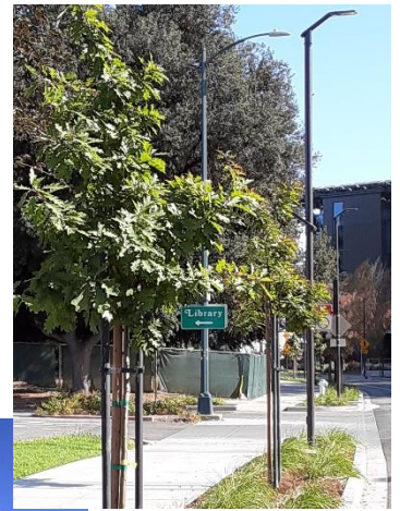
A mature Shumard oak tree with rounded canopy (bottom) and some of the 56 newly-planted Shumard oaks lining both sides of Olive St. by the Library and City Hall. (top)

SO: Well, thank you kindly. It was a pleasure shooting the breeze with you.