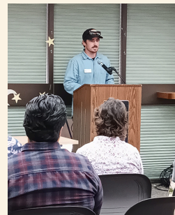
Giants Rising Film Screening