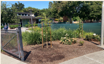
Center: One of the beautiful cherry trees planted in honor of Arbor Day. Below: Tabling during Earth Day